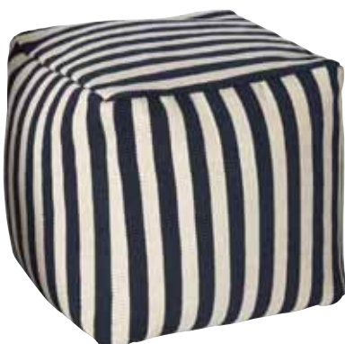
Left: Monty Pouffe, striped monochrome, £89 www.swoon-editions.com

No, I'm not being contrary. One of the joys of 21st century design is that if playing with colour isn't your thing, then monochrome is a perfectly valid alternative.