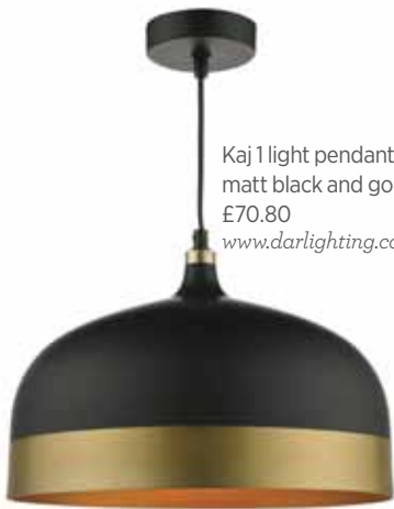
Kaj 1 light pendant matt black and gold, £70.80 www.darlighting.co.uk