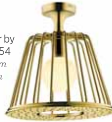
Axor LampShower by Nendo in gold, £1,854 Artisan Tile & Bathroom Studio, Handforth www.artisanbs.co.uk