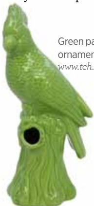
Green parrot ornament, £18 www.tch.net

Well, it is the Year of the Monkey! Bold and dramatic colours in tropical prints, quirky accessories and botanicals create impact with fun: perhaps not for your main reception room, but perfect in a kitchen, conservatory or teen space.