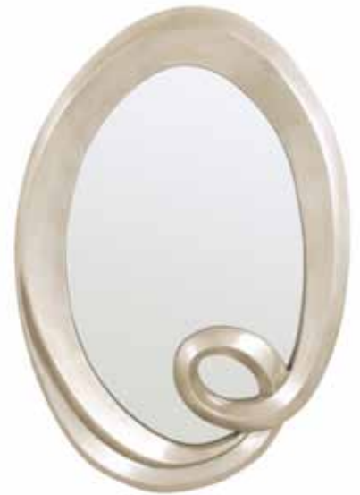
Southside oval mirror, £275 www.chandeliersandmirrors.co.uk

For those who have gone all out on the chandeliers already, mirrors are the next home accessory to get the glamour treatment. Pop something beautiful in your bathroom or spectacular in your hallway, hang a talking point in your lounge or go all out in the dining room – mirrors bring light and sparkle to any space and are a beautiful way to make your personal style statement.