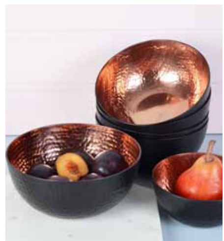
Left: Persian wallpaper, £126 www.in-spaces.com

Rich middle eastern hues of red and orange, repeating patterns and copper accessories bring light and life to the dullest of rooms. The key to its success is to decide on your main colour and then work in shades that compliment rather than contrast, or you're getting to deep into psychedelic country, and nobody wants that.