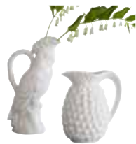
Exotic white porcelain jugs, £34.95 www.rigbyandmac.com

Well, it is the Year of the Monkey! Bold and dramatic colours in tropical prints, quirky accessories and botanicals create impact with fun: perhaps not for your main reception room, but perfect in a kitchen, conservatory or teen space.