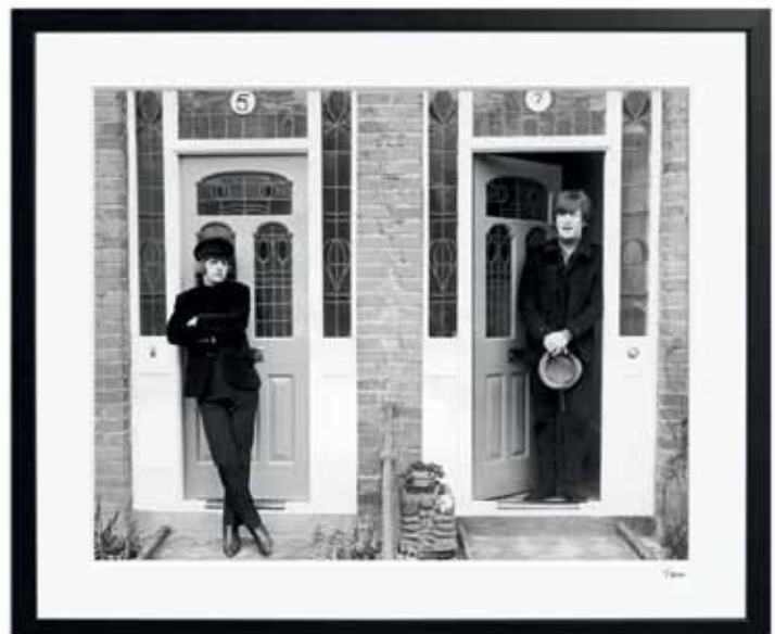
Right: Academy Art Beatles 1965, £99 www.made.com