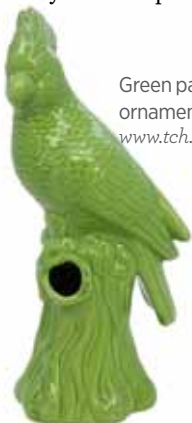
Green parrot ornament, £18 www.tch.net