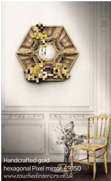
Handcrafted gold hexagonal Pixel mirror, £9,150 www.touchedinteriors.co.uk