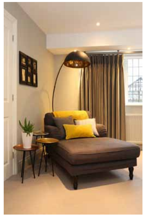
A place to relax: Ruth's bedroom 'reading corner'

'Caroline certainly surprised me with some