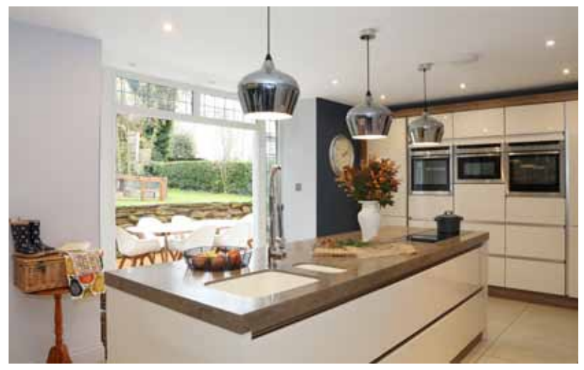
The contemporary kitchen has the same blue walls as used in the hall, to ensure the two rooms flow together

popping shades of pink and yellow about to create a room fit for a very small girl, but also one she can grow into – no cutesy princesses or baby pinks allowed here, thank you!